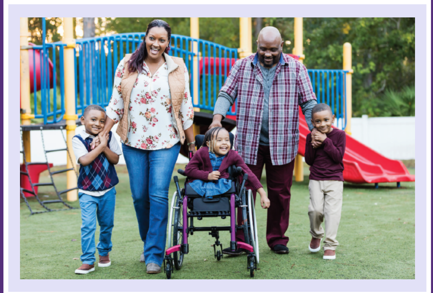
Digital Journal of Supporters

Disability: A Part of the Human Experience